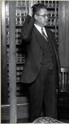
Swearing in as U.S. attorney for Colorado in 1929